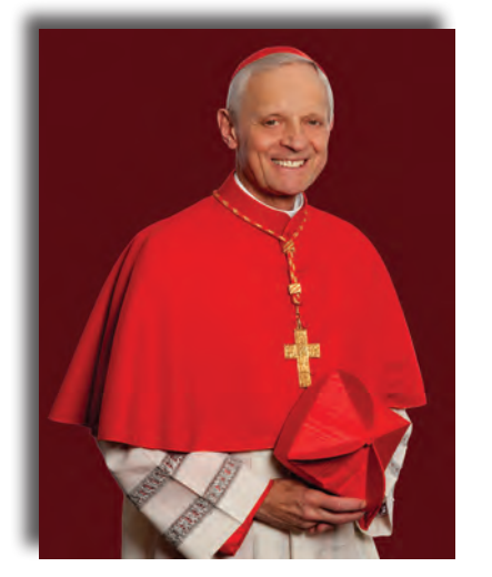
His Eminence Donald Cardinal Wuerl Archbishop of Washington